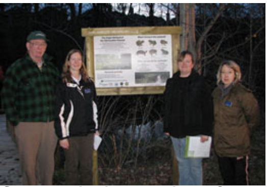
Community learns about frogs

Ausable Bayfield Conservation Authority (ABCA) has announced the winners of its first Watershed Tales student environmental writing competition. A panel of judges included people from the literary sphere, the