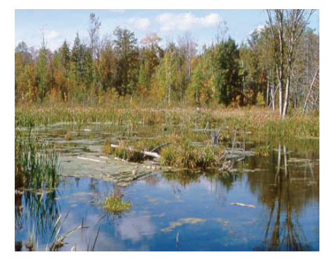
A productive wildlife pond should look very similar to this natural wetland.