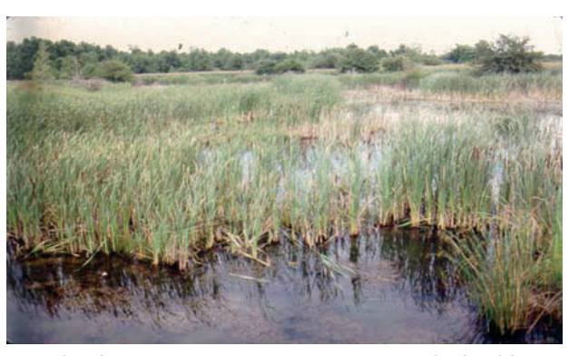
Wetland vegetation is an important part of a healthy wildlife pond. Plants contribute oxygen, absorb nutrients and form the base of the aquatic food chain. Use fencing to exclude livestock from ponds to avoid damage to shoreline vegetation.

The "Habitats for Healthy Waters" program is a three-year (2005-2007) initiative to raise the awareness of wetland values among residents of Elgin, Oxford and Middlesex Counties. This project will also help landowners implement wetland stewardship practices that provide benefits to agriculture and the rural community through a series of demonstration sites, workshops and educational material.