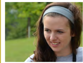
Job Experiences for Youth