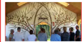
Places to remember loved ones

AUSABLE BAYFIELD CONSERVATION FOUNDATION FOSTERING PARTNERSHIPS | SUPPORTING ACTION