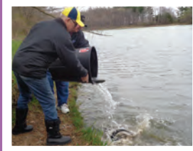
Recreation for Youth