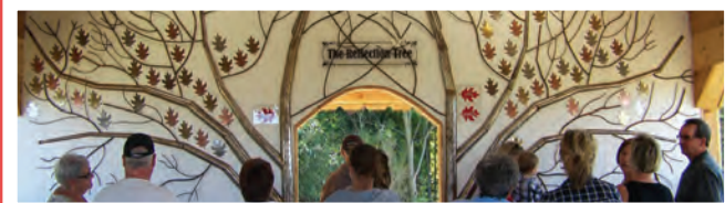
Places to remember loved ones