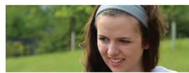
Job Opportunities for Youth