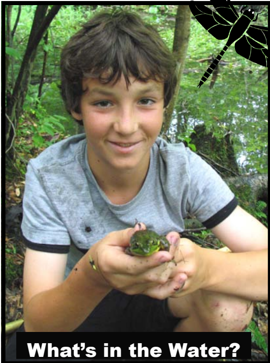
What's in the Water?

Habitat Improvements: Learn about Bluebirds and the success of the Bluebird nesting box programs. Armed with a hammer, nails and wood, students will safely build their very own Bluebird box to create suitable habitat. (Additional charge of $6.00 + tax per kit).