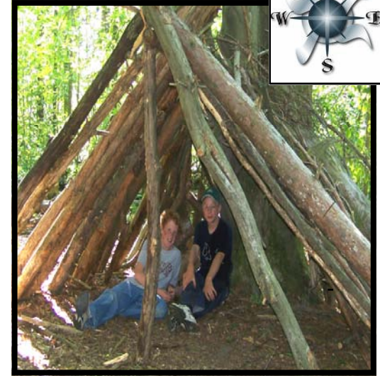
Wilderness Survival Skills

Go Wild (AKA: Survival): Students become connected with the forest ecosystem by role-playing herbivores, omnivores and carnivores in a simulated game of survival. Animals must find food and water while protecting themselves from predators and limiting factors. A Camp Sylvan tradition!