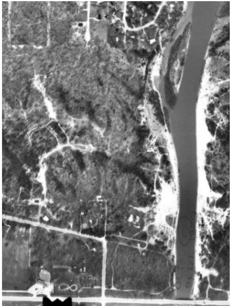
Figure 2: 1975 aerial image of Ausable River Cut Conservation Area and the surrounding area.