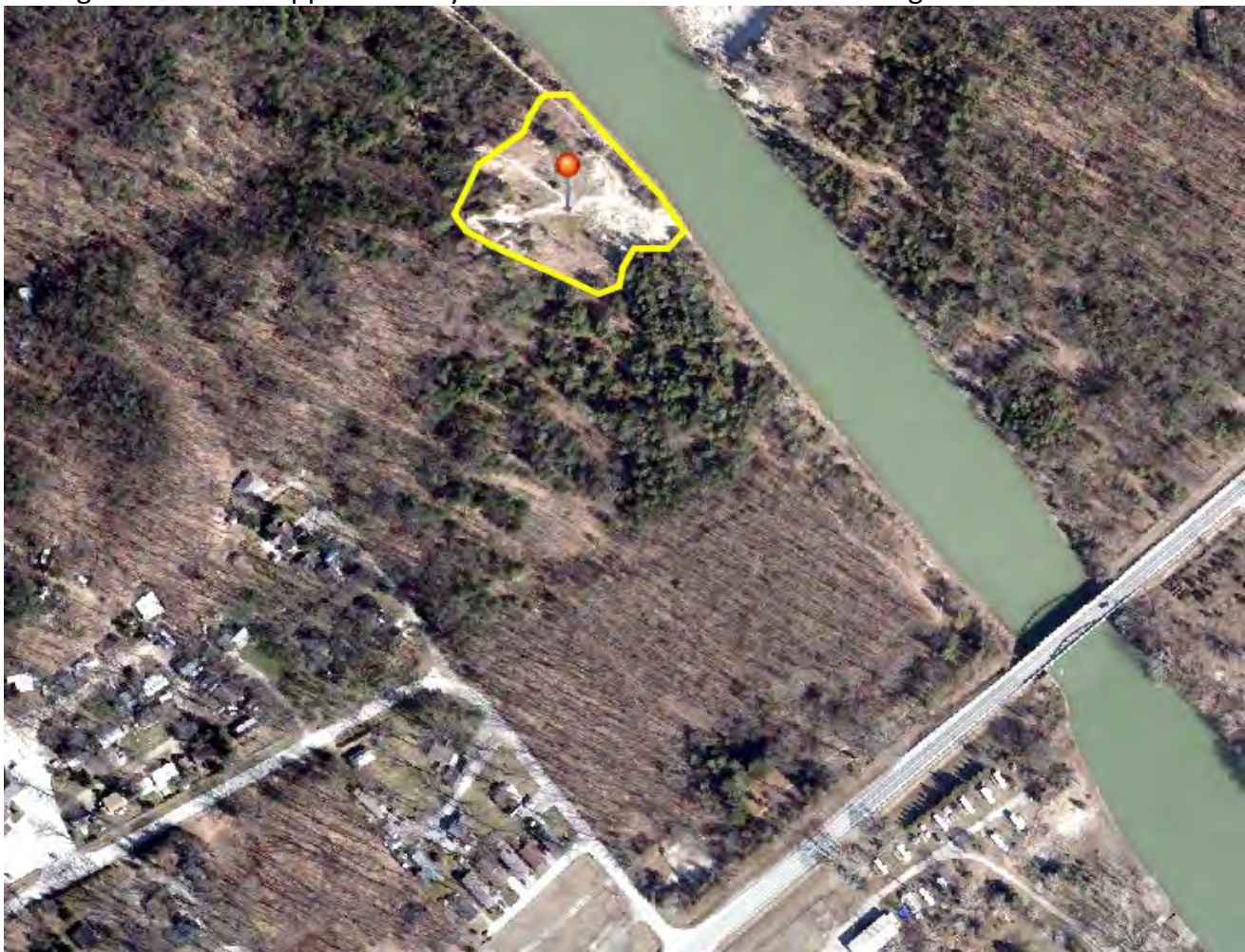
Figure 6: Proposed dune habitat management area described in Recommendation 3.4; the coordinates denoted by the pin are: 17N 429542 4786023.

Description: Significant progress was made to mitigate threats to the dune habitat that had caused uncontrolled erosion and overall habitat degradation. As the dune continues to succeed, ABCA should manage encroaching woody species, as resources allow, to promote dune habitat and the biodiversity that this area supports. The proposed dune habitat management area is approximately 0.75-hectares and is denoted in Figure 6.