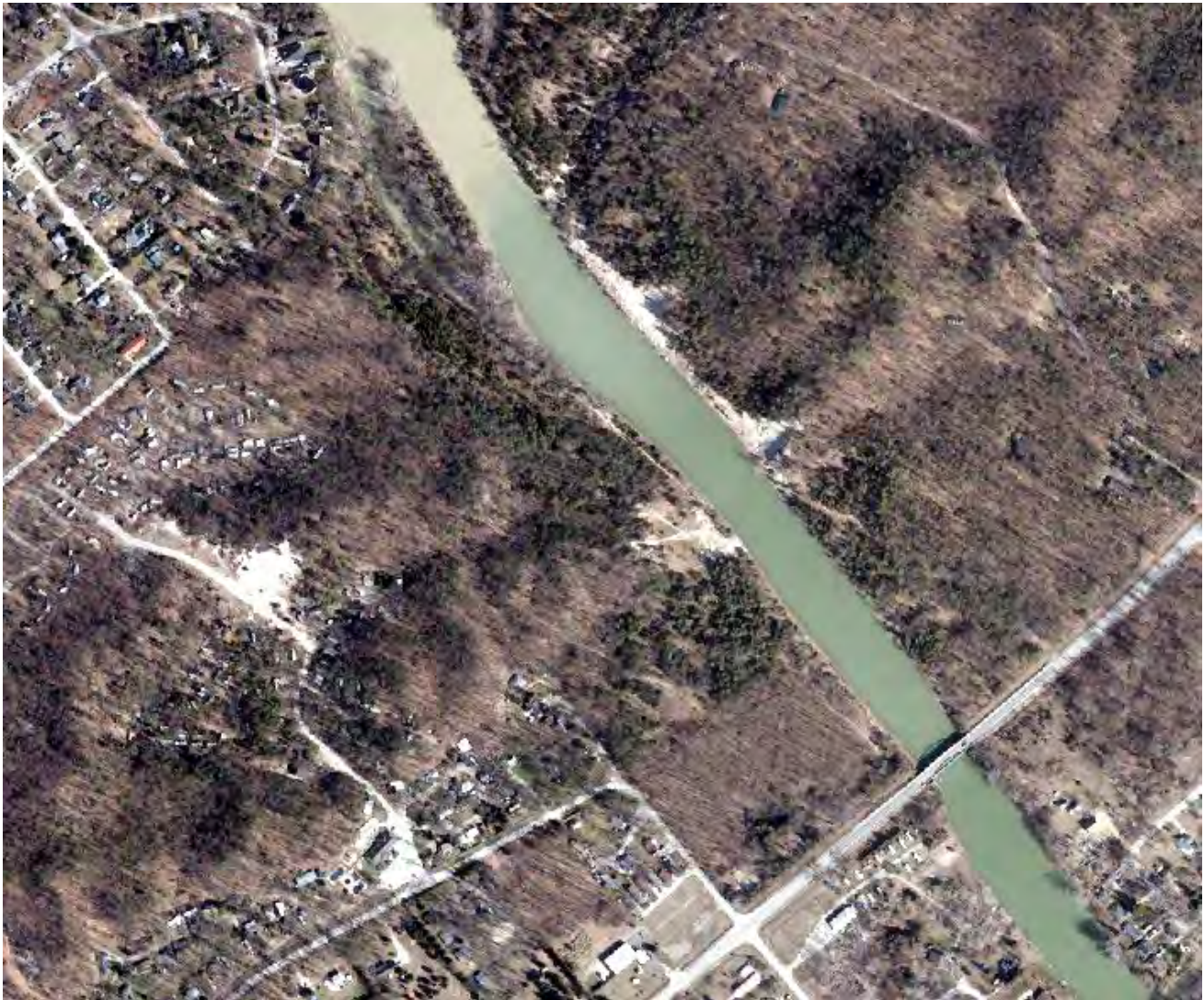
Figure 4: 2020 aerial image of the Ausable River Cut Conservation Area and surrounding area.