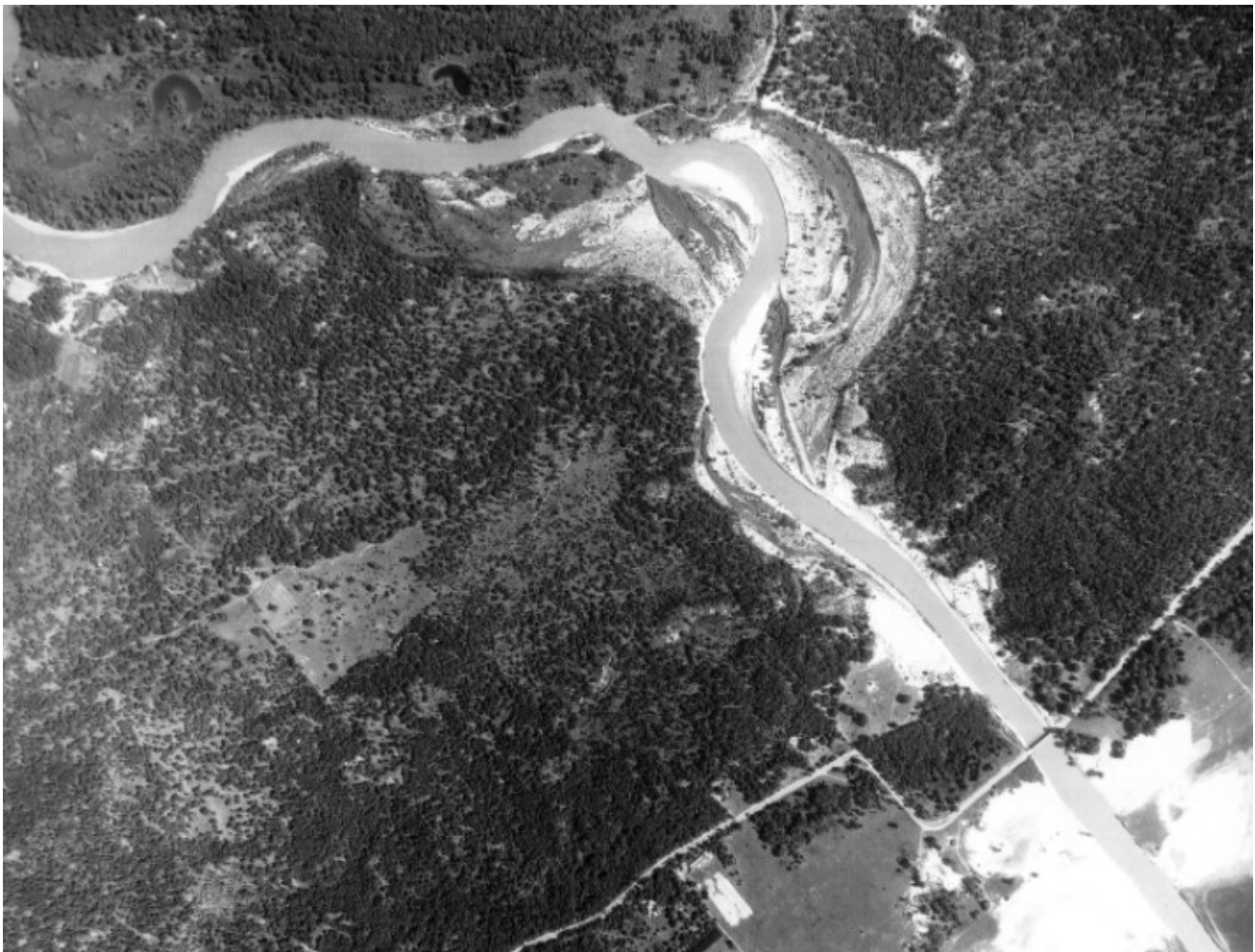
Figure 1: 1947 aerial image of Ausable River Cut Conservation Area and surrounding area.

The areas surrounding the property have undergone significant landscape-level changes over the past eighty years. In 1947, there was little to no surrounding development, and the highway followed a different route. The 1947 aerial image (Figure 1) depicts a natural landscape dominated by forest canopy that was, on average, sparser than what is observed today. The 1947 aerial image indicates that the property experienced minimal development or disturbance, aside from a small area that may have been mowed. At that time, the unvegetated dune stood out as a prominent feature.