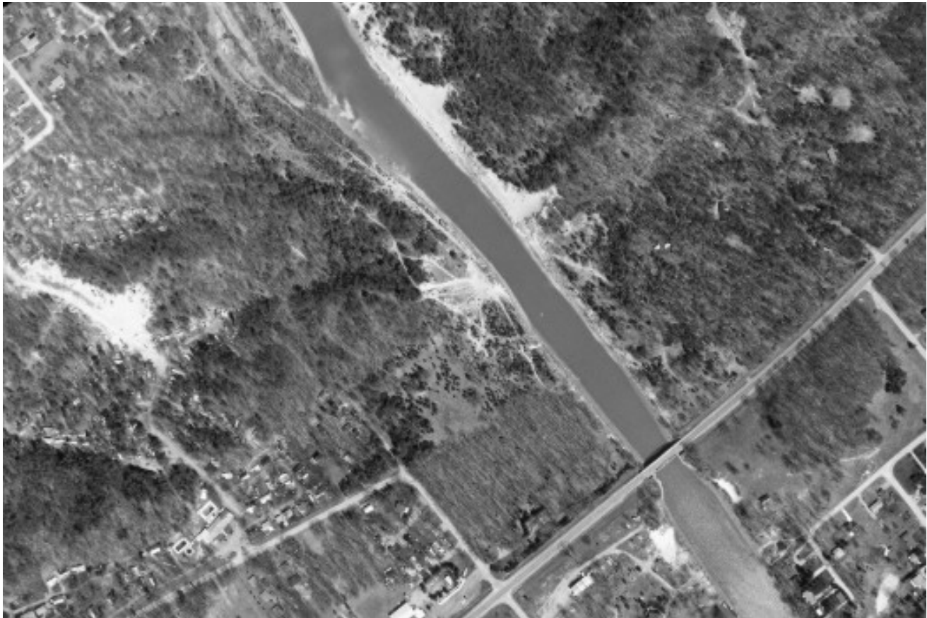
Figure 4: 2000 aerial image of the Ausable River Cut Conservation Area and the surrounding area.

Scots pine was historically used in reforestation efforts, with a relatively high abundance of Scots pine planted along the Cut, downstream of the current highway. Due to Scots pine that were likely planted at ARCA, as well as mature trees on adjacent properties seeding into the site, a significant population of Scots pine became established on the property, posing a threat to forest health and biodiversity. These trees may be observed in the 1989 and 2000 aerial images, but are most apparent in the 2020 aerial image (Figure 5). Several iterations of Scots pine management have been completed at the property by ABCA staff. Based on both documented management efforts, as well as those recalled through institutional knowledge, management occurred in 2010, 2019 and 2023.