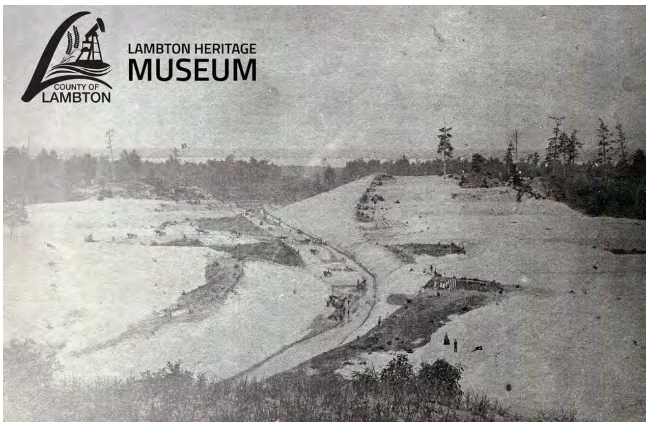
Figure 5: An image from the Lambton Heritage Museum's website, described as 'Teams of horses and labourers building the Cut from the Ausable River to Port Franks. You can see Lake Huron in the background.'

ARCA provides an opportunity to partner with the County of Lambton's Cultural Services department to formalize ARCA as a location to view these historical landscape alterations.