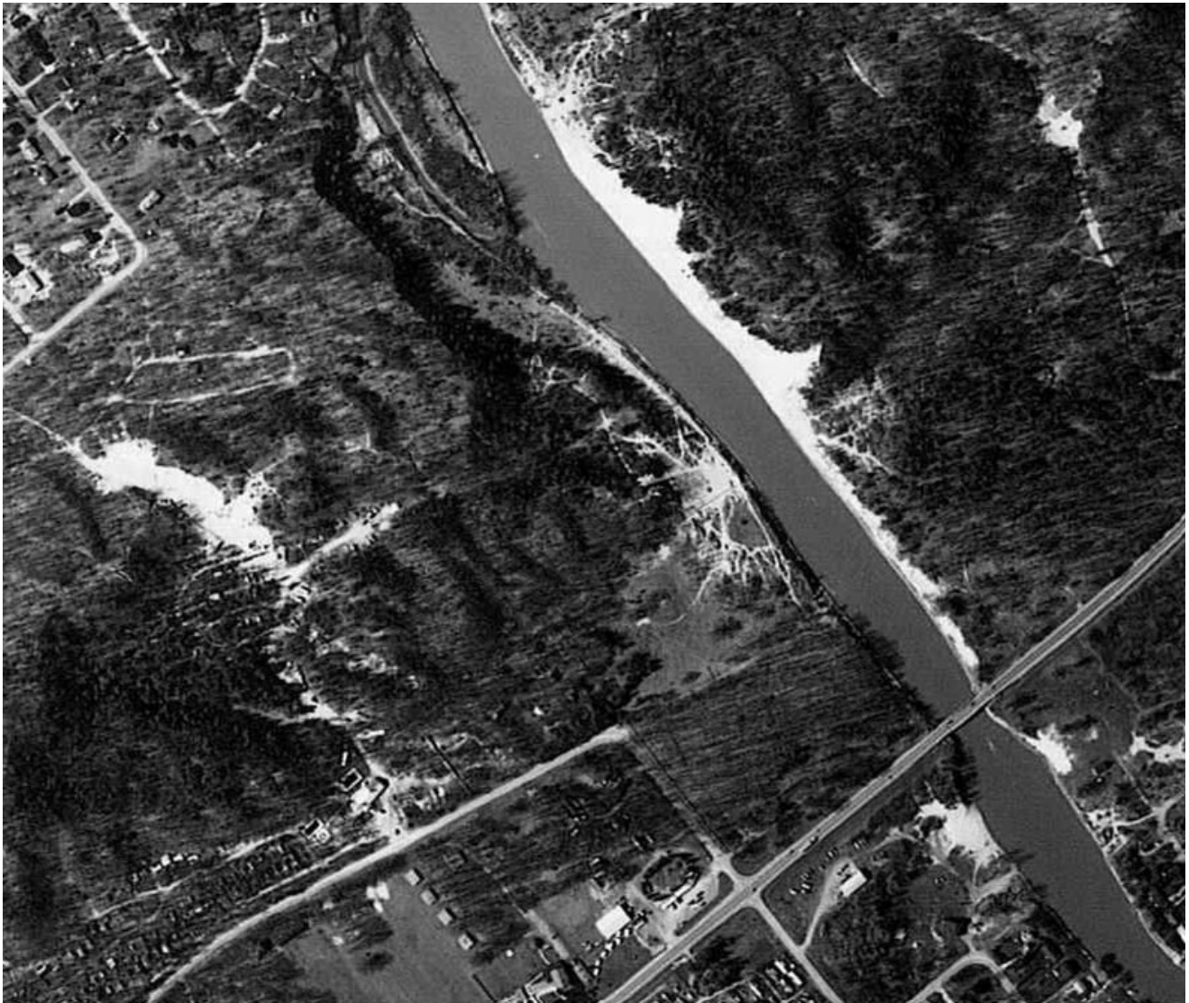
Figure 3: 1989 aerial image of Ausable River Cut Conservation Area and the surrounding area.

The 1989 aerial image (Figure 3) suggests that the infrastructure remained visible on the property, although it is unclear whether it was still maintained or in use. The network of unauthorized trails – most evident in the dune habitat – is clearly shown in the image.