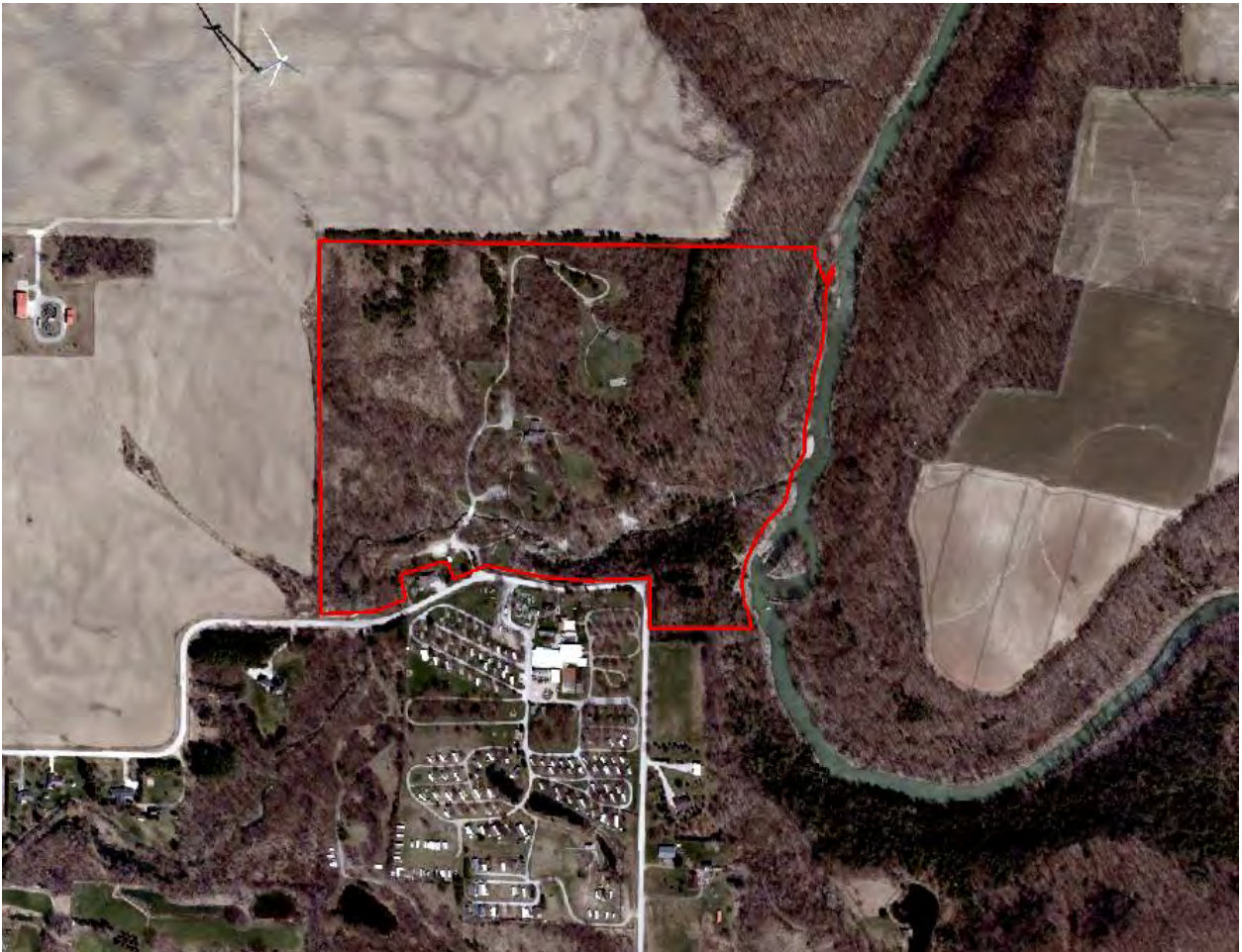
Figure 5: 2020 aerial image of Rock Glen Conservation Area. The red polygon denotes the approximate property boundary of RGCA in 2025.

In response to high visitor numbers in 2020, staff implemented several upgrades to increase capacity while protecting RGCA's ecological integrity. The lower parking lot, west of the Hobbs-McKenzie Drain crossing was expanded to accommodate an additional 24 vehicles. Additional parking spaces were also added to the upper loop, to support increased use of the pavilion. To reduce pressure on heavily used amenities, a new trail was established in 2023. It encourages visitor dispersion and offers an alternative route through the Ausable River Valley, linking the lower drain crossing to the tablelands near the north pavilion.