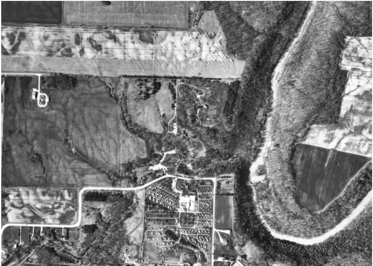
Figure 4: 1999 aerial image of Rock Glen Conservation Area. The red polygon denotes the approximate property boundary of RGCA in 2025.

The 2004 Master Plan proposed converting a low-quality ash plantation into a more suitable ecosystem, such as tall grass prairie or old-field transition. Soon after, Emerald Ash Borer (EAB) killed the ash trees at RGCA, prompting significant staff resources to remove hazardous trees. In 2014, ABCA and community groups planted native species, including sugar maple, silver maple, tulip tree, sycamore, Kentucky coffee tree, red oak, chinquapin oak, Ohio buckeye, and redbud, to reforest the area. Some areas, particularly in the northwest have naturally transitioned to old-field conditions, this is visible in Figure 5.