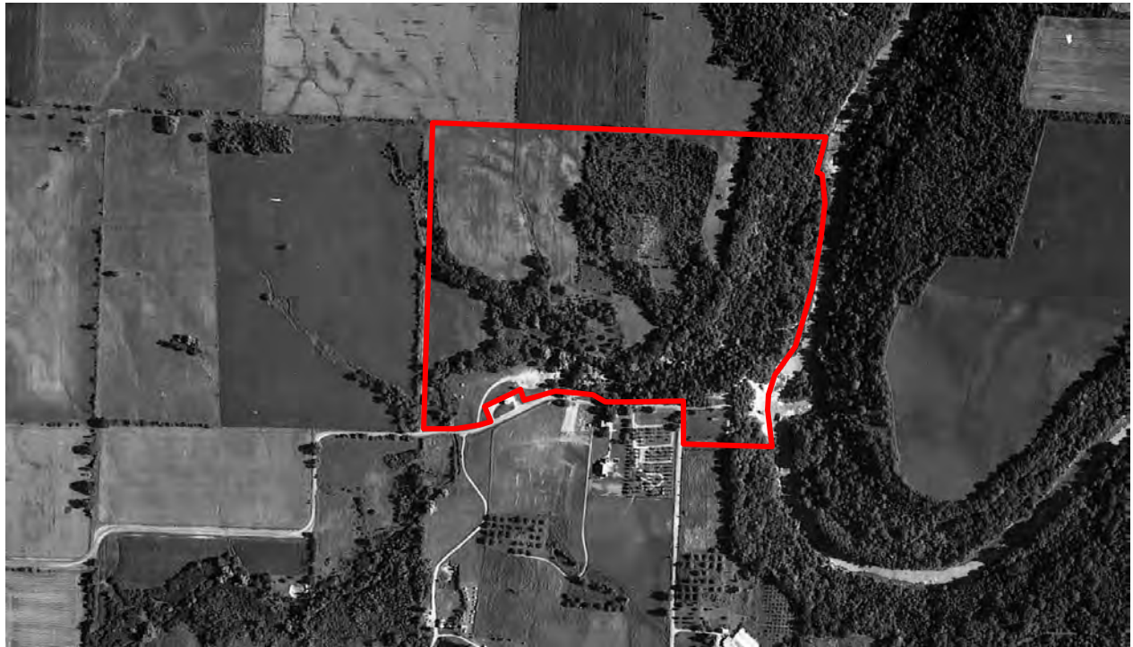
Figure 2: 1972 aerial image of Rock Glen Conservation Area. The red polygon denotes the approximate property boundary of RGCA in 2025.

In the 1970s and 1980s, staff recognized that intensive, uncontrolled use of the gorge was degrading its condition, as evidence by a maze of random, intersecting trails. A two-part strategy was implemented: developing recreation within the more resilient tablelands, and creating a defined trail system to minimize ecological impact. The 1988 Master Plan built upon the original plan, emphasizing sustainable recreation through responsible development of the site. Early improvements to the tablelands are visible in the 1989 aerial image (Figure 3). To guide access, stairs to the Ausable Gorge were also constructed during this time. The Arkona Lions Museum and Information Centre was constructed in 1986.