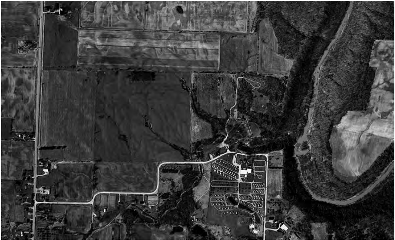
Figure 3: 1989 aerial image of Rock Glen Conservation Area. The red polygon denotes the approximate property boundary of RGCA in 2025.

By the late 1990's, development at RGCA was substantially complete. The 1999 aerial image (Figure 4) shows a layout similar how RGCA is at the time of this update. According to the 1988 Master Plan, deciduous and coniferous plantations – planted between 1974 and 1976 using species such as soft maple, white ash, white pine, and spruce – had reached heights of 2 to 5 metres in height by 1988. Some plantations are visible in the 1999 image, though the sparse conifers in the northwest suggest low survival rates. A single row of each, white pine, cedar, and spruce, was also planted along the northern boundary.