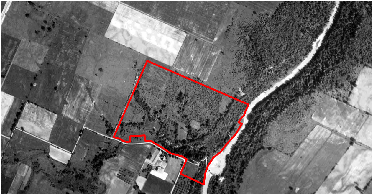
Figure 1: 1947 aerial image of Rock Glen Conservation Area. The red polygon denotes the approximate property boundary of RGCA in 2025.

Figure 2 shows the property and surrounding area in 1972, shortly after ABCA acquired the final parcel in 1969. Figure 2 suggests that the most intensive agricultural use occurred just before ABCA's ownership of the complete area. The 1972 aerial image (Figure 2) highlights the transition in agricultural practices that likely occurred at the property. More land was cleared for fields to support row crops, and it appears that the forest matured where it was not cleared, suggesting that livestock were no longer present to inhibit regeneration.