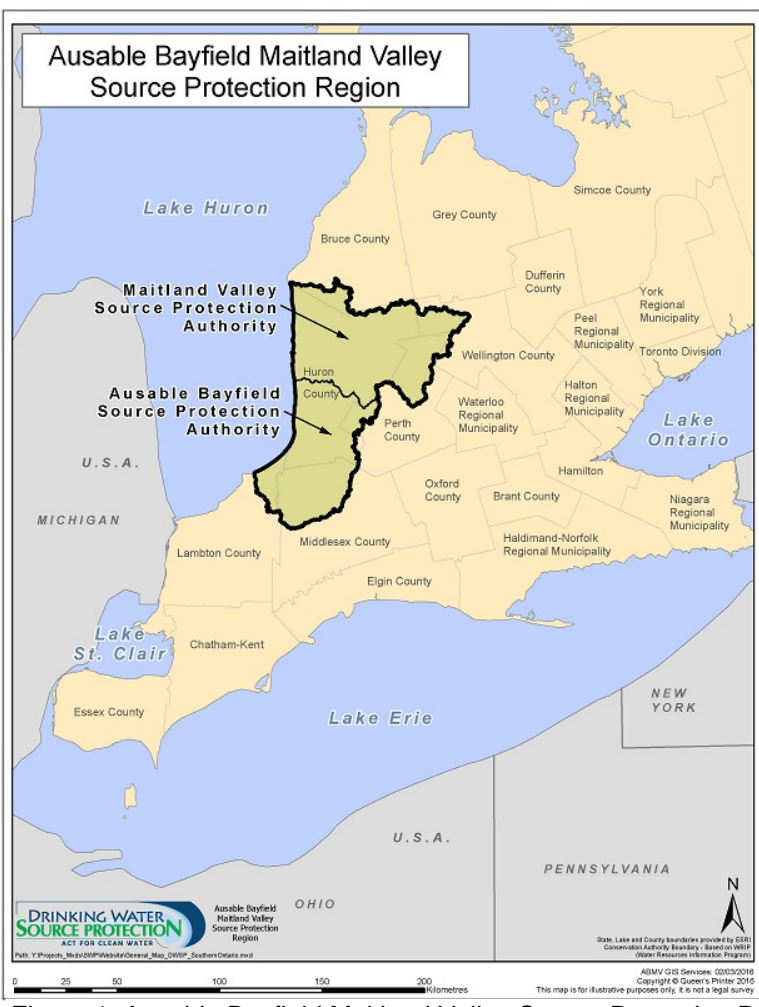
Figure 1. Ausable Bayfield Maitland Valley Source Protection Region Page 1 of 8

This is the fifth annual progress report submitted for the Ausable Bayfield Maitland Valley (ABMV) Source Protection Region. It covers the period of April 2015 to December 31st, 2021, and summarizes progress made in the year 2021.