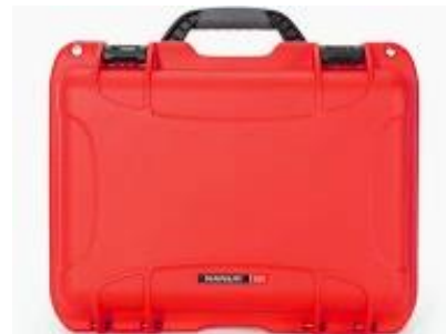
Figure 2: Example of a mobile case