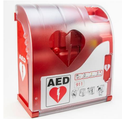
Figure 1: Example of an AIVIA 200 Outdoor Cabinet

The two donated AEDs would consist of LIFEPAK CR2 units, along with two housing units: one mobile case to be kept in the Gate House and one AIVIA 200 outdoor cabinet to be mounted on the exterior of the Museum. The outdoor cabinet provides access to an AED for emergency use by community members. Cardiac arrest can happen anywhere, at any time, to anyone. In a cardiac arrest emergency, every second matters — prompt access to an AED can significantly improve the chances of survival while emergency responders are enroute. The AED is housed in an Aivia 200 Outdoor Cabinet that is temperature-regulated and alarmed to ensure the device remains secure and ready for use when needed.