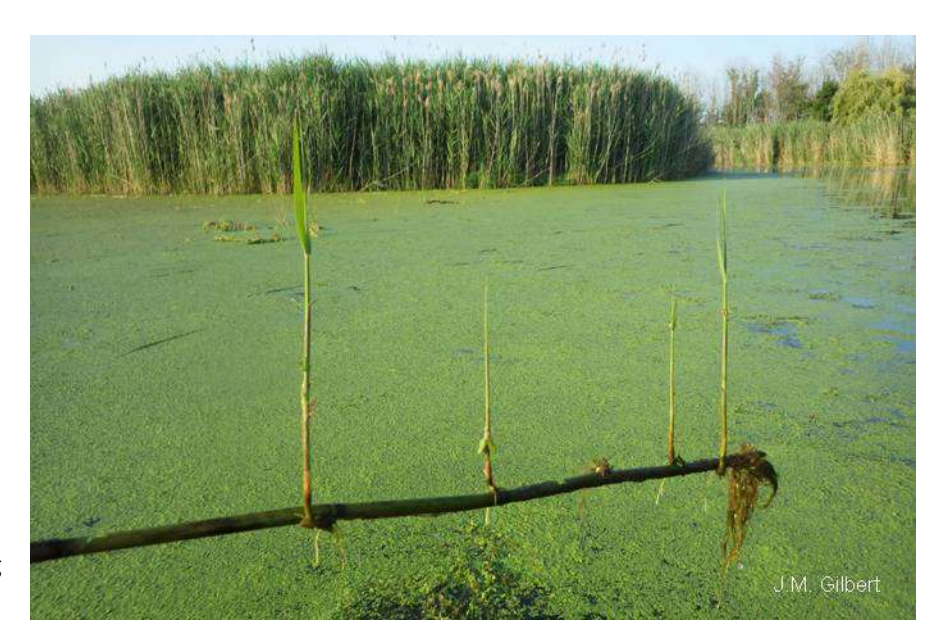
Figure 9. New shoots emerging from an invasive Phragmites stalk found floating in Sturgeon Creek, Leamington, ON.

Disturbed sites (e.g. from construction) are the most vulnerable to colonization, however even small open, moist patches within undisturbed areas can become colonized.