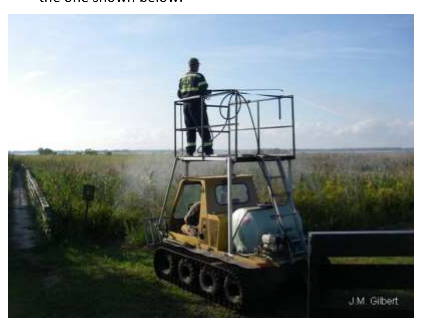
Figure 14. Frank Letourneau (Dover Agri-Serve) using a retrofitted Centaur™ to control invasive Phragmites located within difficult- to-access terrain.

Large or more difficult to access cells can be controlled using retrofitted all terrain vehicles such as the one shown below.