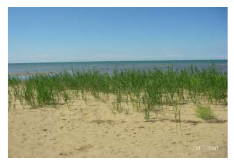
Figure 5. Invasive Phragmites just starting to colonize a beach on Lake Huron.

Pioneer populations are much smaller in size and are often overlooked or not seen as a threat. At this stage the plants could be confused with other grasses and care must be taken to ensure proper identification. However, this is the best stage to initiate control.