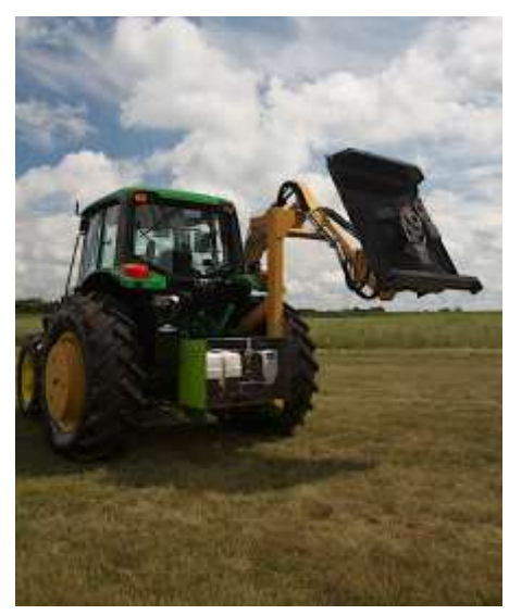
Figure 11. A Diamond WetBlade™ system.

While this system continues to undergo refinements to increase its effectiveness, currently it has a much lower control efficacy compared to use of conventional spray equipment. This means that the same cell may need to be treated four to five years in succession before 100% control can be attained. Timing for herbicide application