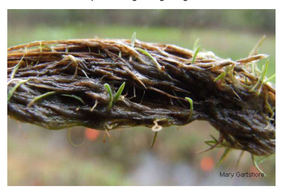
Figure 8. Germinating invasive Phragmites seeds found floating in the Detroit River.

Seeds can be dispersed by winds, up to a 10 km radius. Seed germination rates tend to be low, but this increases where plants are growing in high nutrient conditions.