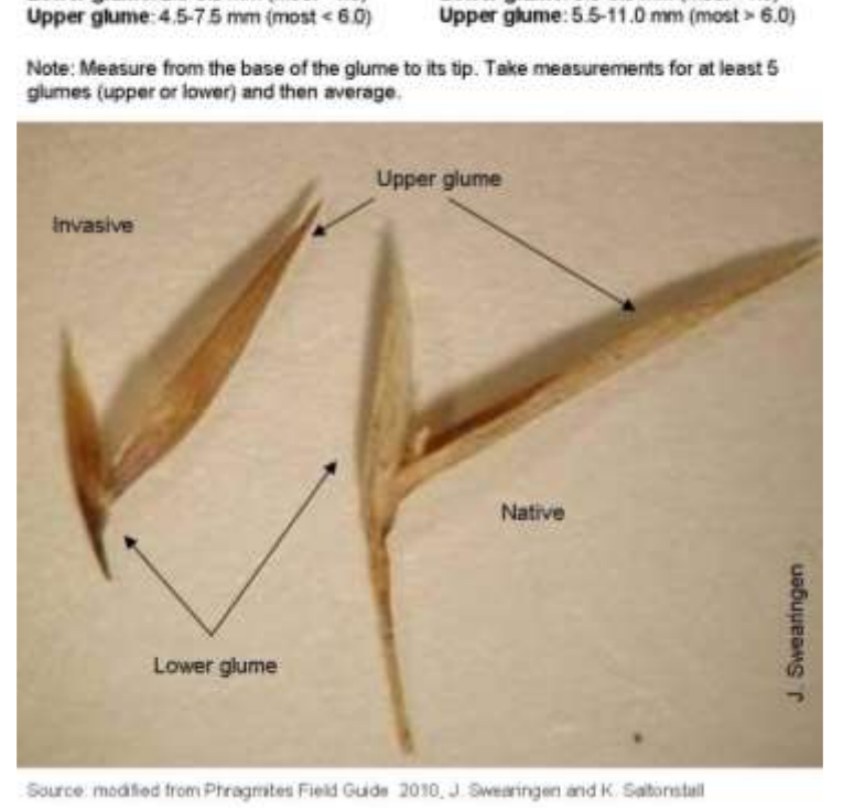
Figure 6. Comparison of glume lengths between invasive and native Phragmites.