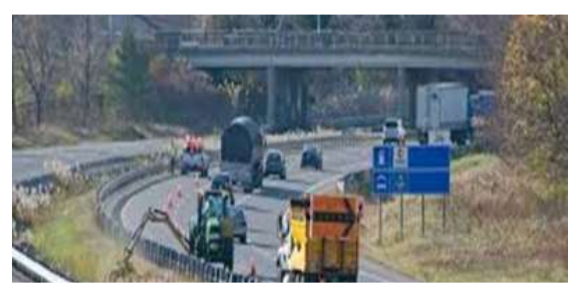
Figure 12. Steve Ford (Green Stream) controlling Phragmites on a section of Highway 403 using WetBlade™ equipment.

This method is especially valuable in areas where broadcast spraying of herbicides is not possible, or where there are open water body sources or if the application area is close to livestock pasture areas. Also, because no atomization of the herbicide occurs, there is virtually no drift, allowing the WetBlade™ application system to be used in windy conditions.