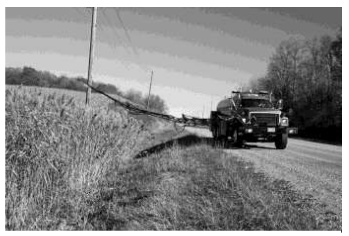
Figure 13 Boom sprayer treating roadside stand of Phragmites.