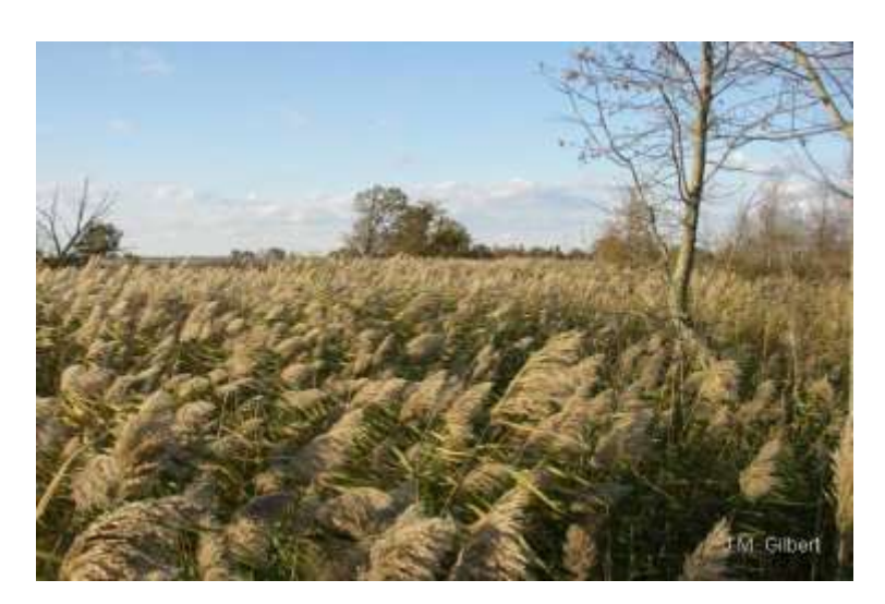
Figure 1. Large monotypic Phragmites cell in a Lake Erie coastal wetland.

Phragmites australis is a robust perennial grass capable of developing into large mono-dominant stands.