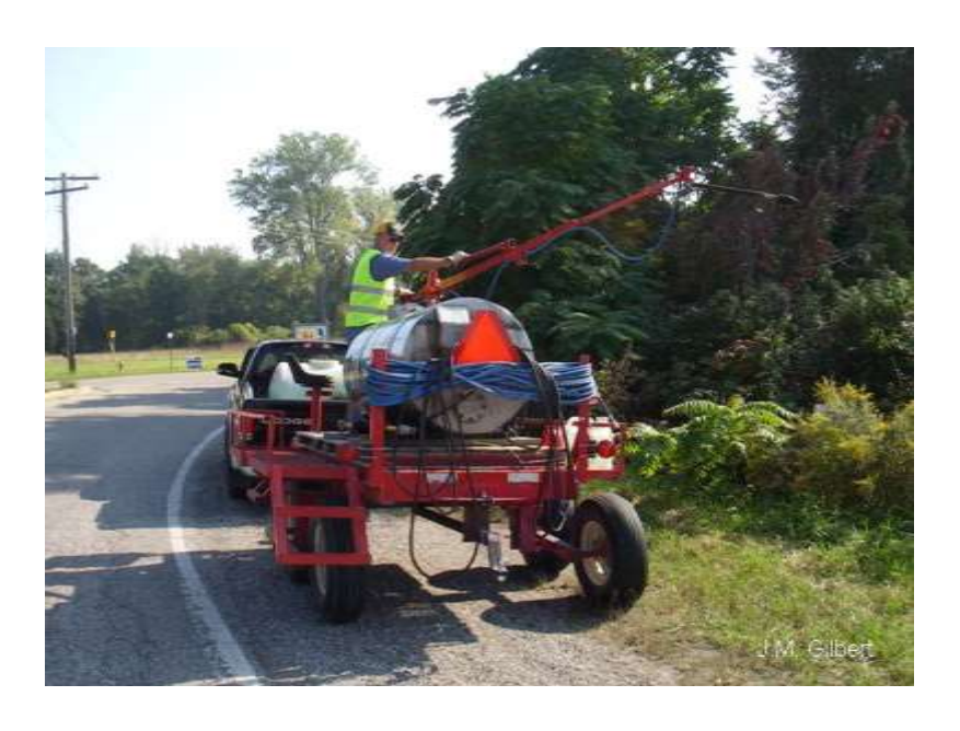
Figure 13. Frank Letourneau (Dover Agri-Serve) using a boom sprayer to control invasive Phragmites along a road in Chatham-Kent.

Large or more difficult to access cells can be controlled using retrofitted all terrain vehicles such as the one shown below.