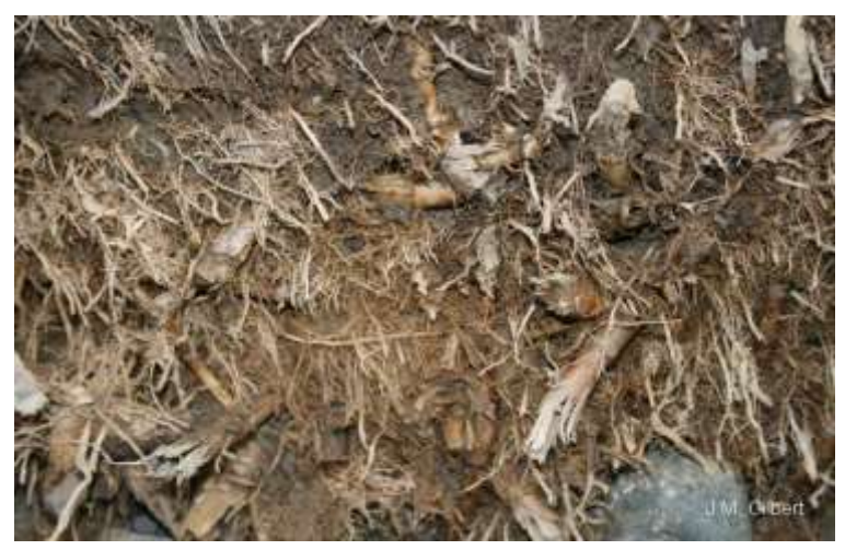
Figure 3. Exposed invasive Phragmites rhizomes and roots along the Shawshawanda Creek at Kettle Point, Lake Huron.

Below ground the rhizomes and roots form a dense, thick mat that can be several metres thick.