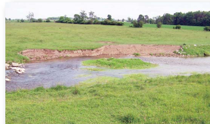
BEFORE — Photo above shows a local property before a project to reduce sediment, bacteria and nutrient-loading.

Ausable Bayfield Conservation Authority has a local board of directors selected by 12 member municipalities. The members are usually elected representatives but municipalities have the option of selecting a representative