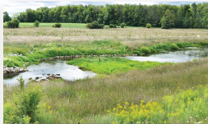
PRESENT-DAY — Erosion control, livestock fencing and tree-planting improved water quality at this property.