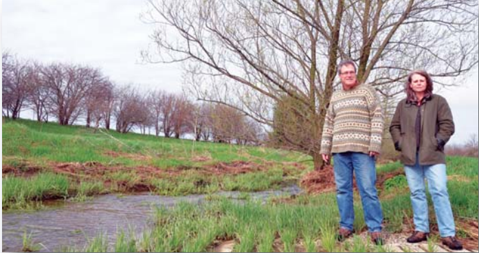
Individuals like you have been actively involved in protection and improvement of Ausable Bayfield watersheds.