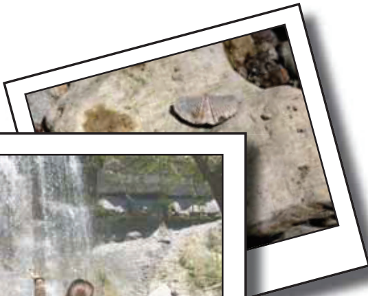
Seeing first-hand formations of rock and the fossils found in them!

We offer many opportunities for your students to experience this popular traditional Canadian activity. ABCA staff can come to your school and lead a 1 or 2 hour outdoor snowshoe program OR schools can rent snowshoes for the day OR classes can go to Morrison Dam C.A. for a 2 hour ABCA-instructed snowshoe program. For instructed programs, students will be given an overview of the history and importance of snowshoeing in Canada. Students will also learn a variety of techniques and test out their newly acquired skills through participation in snowshoeing games and activities.